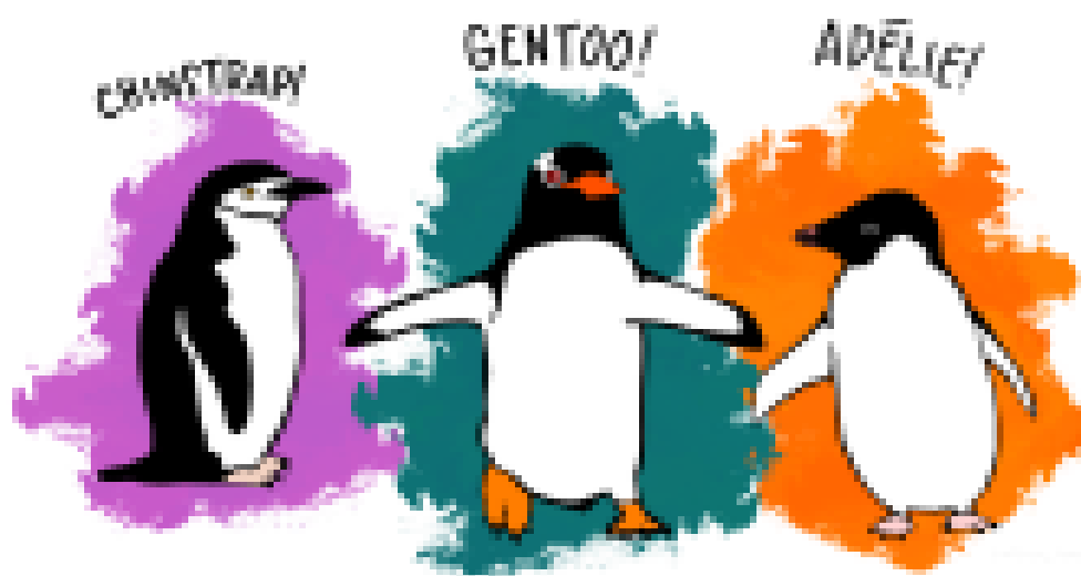
Figure 1: Artwork by allison_horst